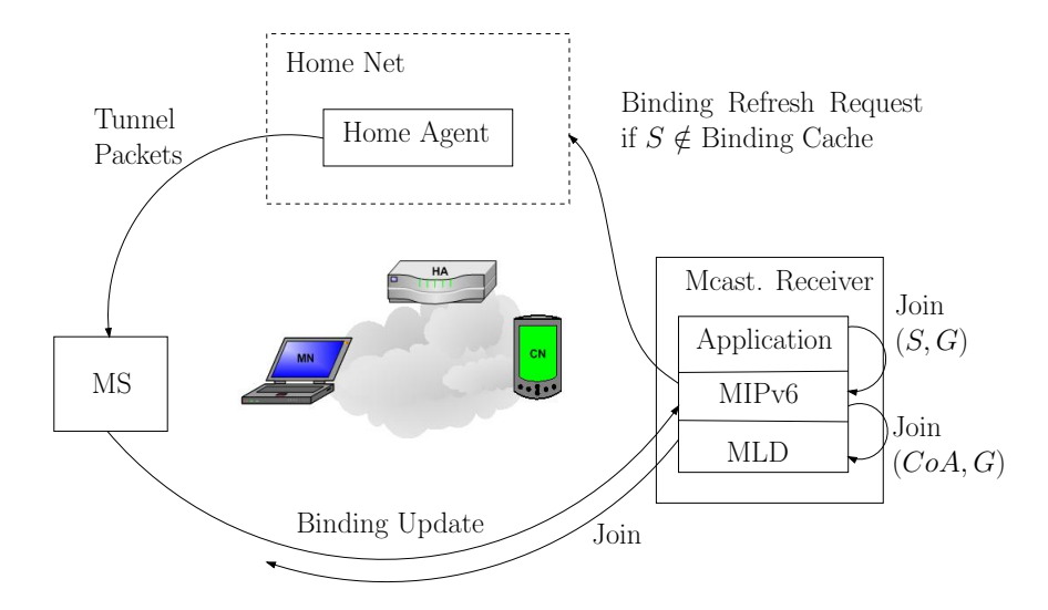
Figure 1: Initial care-of address discovery by receiver's mobile IPv6 stack.

source address. This may be achieved by submitting a binding refresh request (s. [2]) to the home address and will lead to a valid binding cache entry. Thereafter, the multicast receiver will be able to join the multicast session, which appears to be a (HoA, G) channel to the session transport layer.