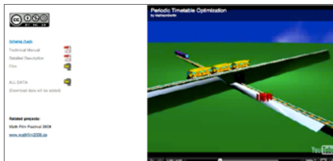
Time table optimization

The 2005 timetable for this network was computed by Matheon at the Institute of Mathematics at TU Berlin. The key was state-of-the-art combinatorial optimisation