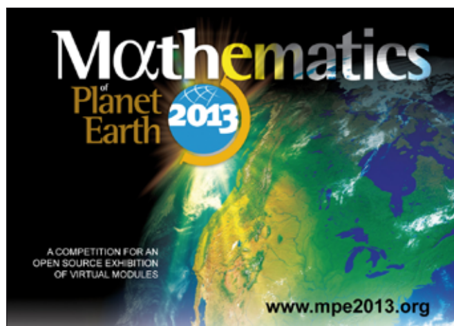
Logo of the Mathematics of Planet Earth Initiative