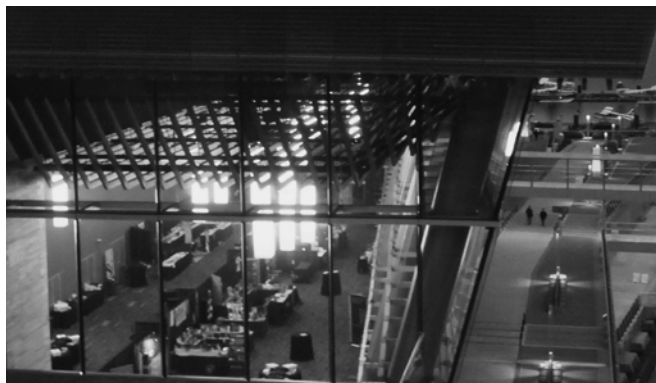
The conference centre at night, showing the grassy roof on top and the book exhibition within.

If it wasn’t enough to host the Winter Olympics in 2010, Vancouver in 2011 saw the influx of nearly 3000 mathematicians from over 70 countries to attend the 7th International Congress on Industrial and Applied Mathematics (ICIAM 2011). A splendid new conference centre