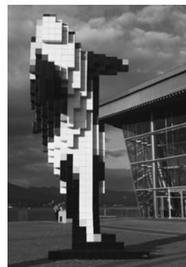
The orca sculpture outside the conference centre.